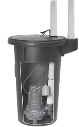
912-0056 (Top Discharge)