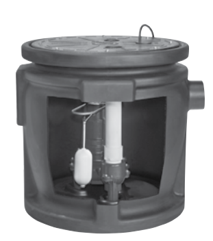
912-0116 Poly Molded Basin (Top Discharge)