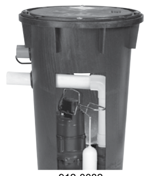
912-0082 (Side Discharge)