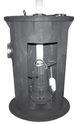
912-0088 Premium Basin (Top Discharge)